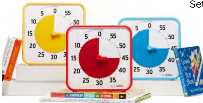
Primary Colour Set