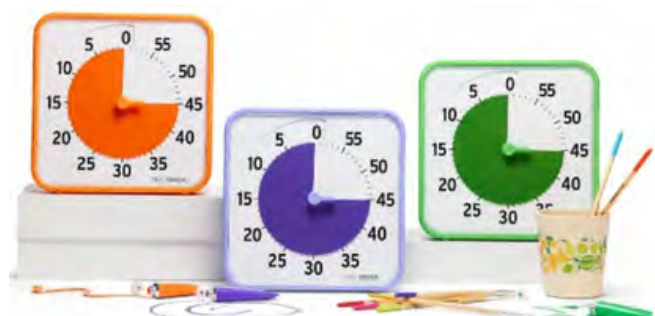
Secondary Colour Set