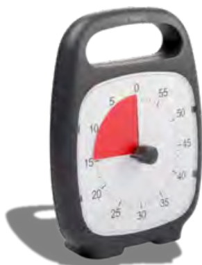
Time Timer PLUS 13.75cm x 17.5cm