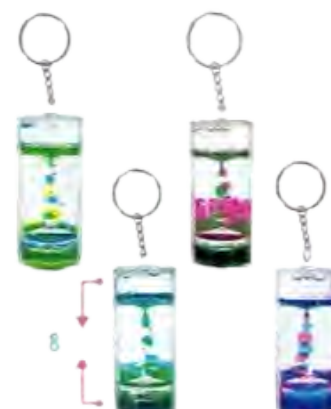
Liquid Key Ring Sensory Tool