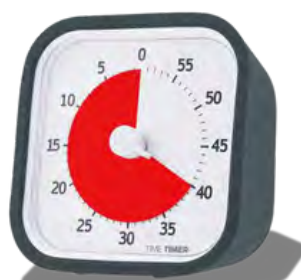
Time Timer MOD 9 x 9 cm