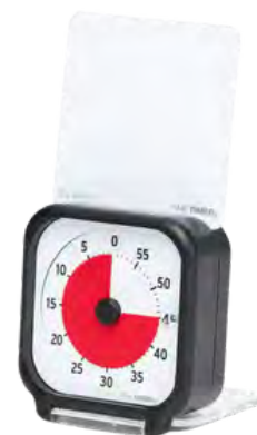
Time Timer – 7.6cm Small